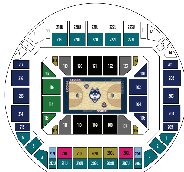
2021 RENEWAL SEASON TICKET & DONATION PRICING